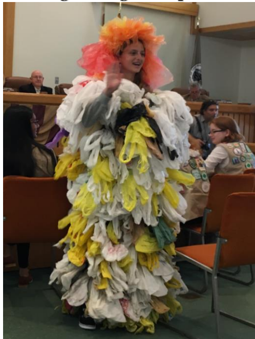
Girl Scouts gave testimony at the hearing

Attended NJ joint committee hearing on single-use plastics and plastic waste (see p. 3)