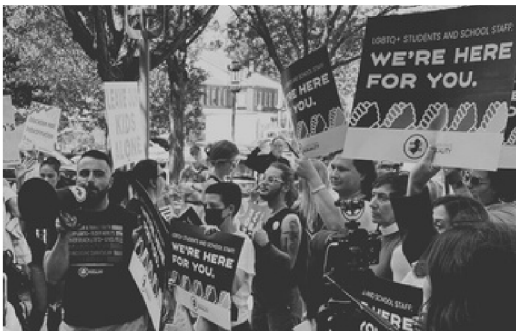
From top: March to End Fossil Fuels; rally outside CoreCivic v. Murphy; counter-protesters at State Board of Education meeting.