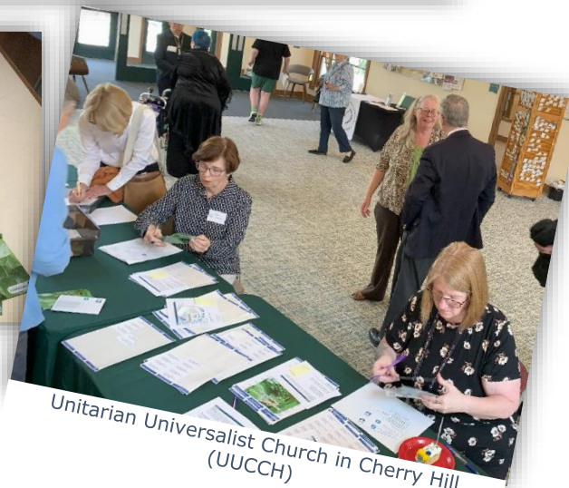
Unitarian Universalist Church in Cherry Hill (UUCCH)