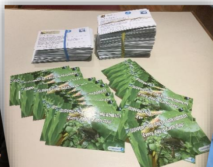
Some of UUCCH's signed postcards, ready to go!